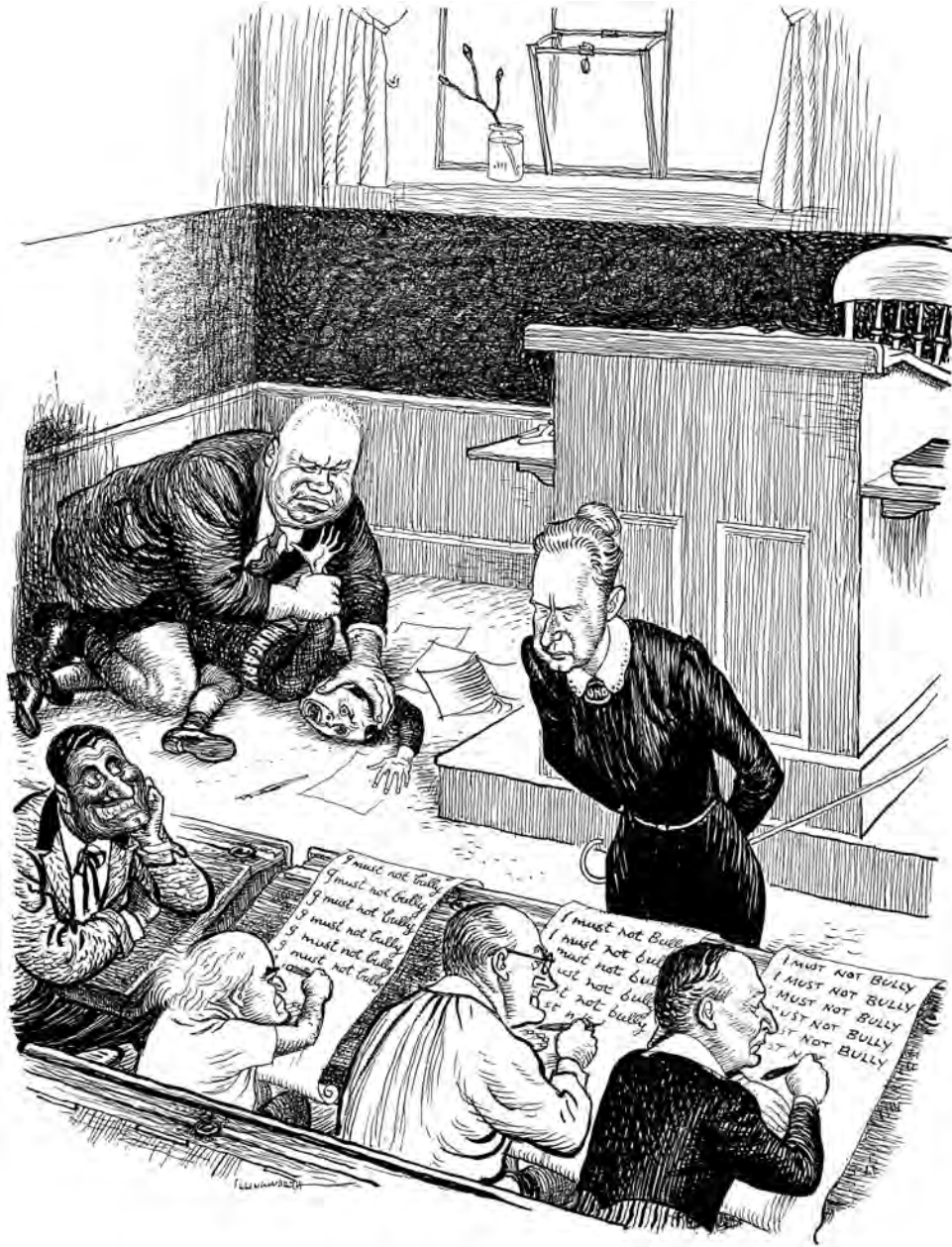
A cartoon from a British magazine published in November 1956, during the Suez Crisis. The figures at the bottom of the cartoon represent President Nasser of Egypt and the governments of Israel, Britain and France.