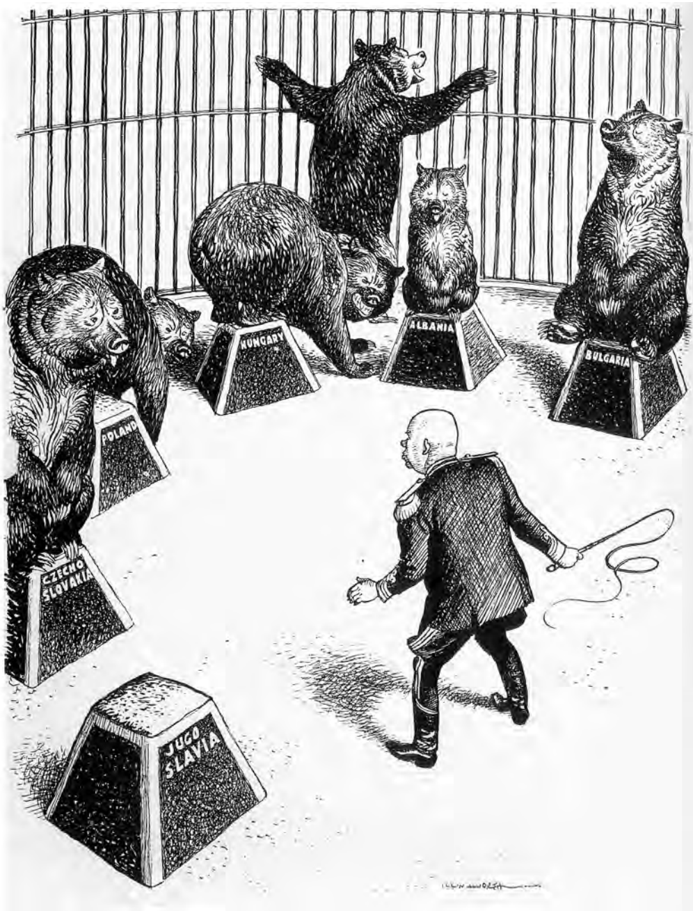
A cartoon from a British magazine, October 1956. The ringmaster is Khrushchev.